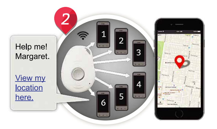
It then sends 6 help texts with your exact location and then calls those people consecutively.