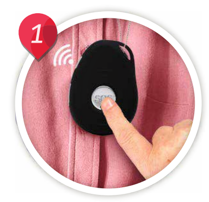
Whether you're at home or outdoors and need help, simply press the SOS button.